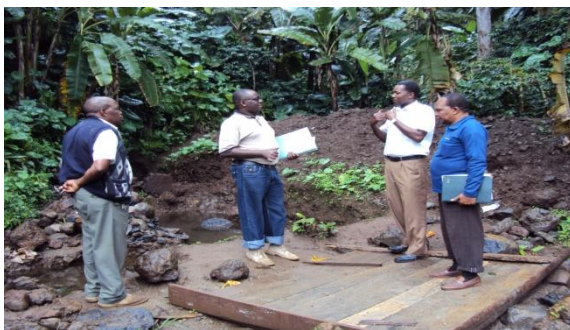
Site Meeting with the Contractor Construction of Water Intake for Msareni Water project