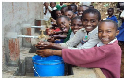
Pupils of Msareni Primary School enjoying piped water When flowing for the first time