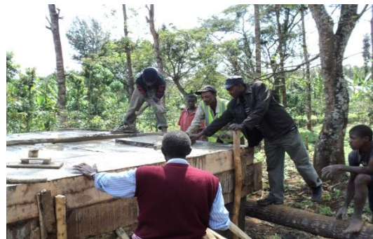
Site Work – Construction of 10m 3 Storage Tank for Msareni Water Project