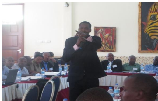
Picture 1-3: Part of Training Sessions Conducted by Market Plus Trainer